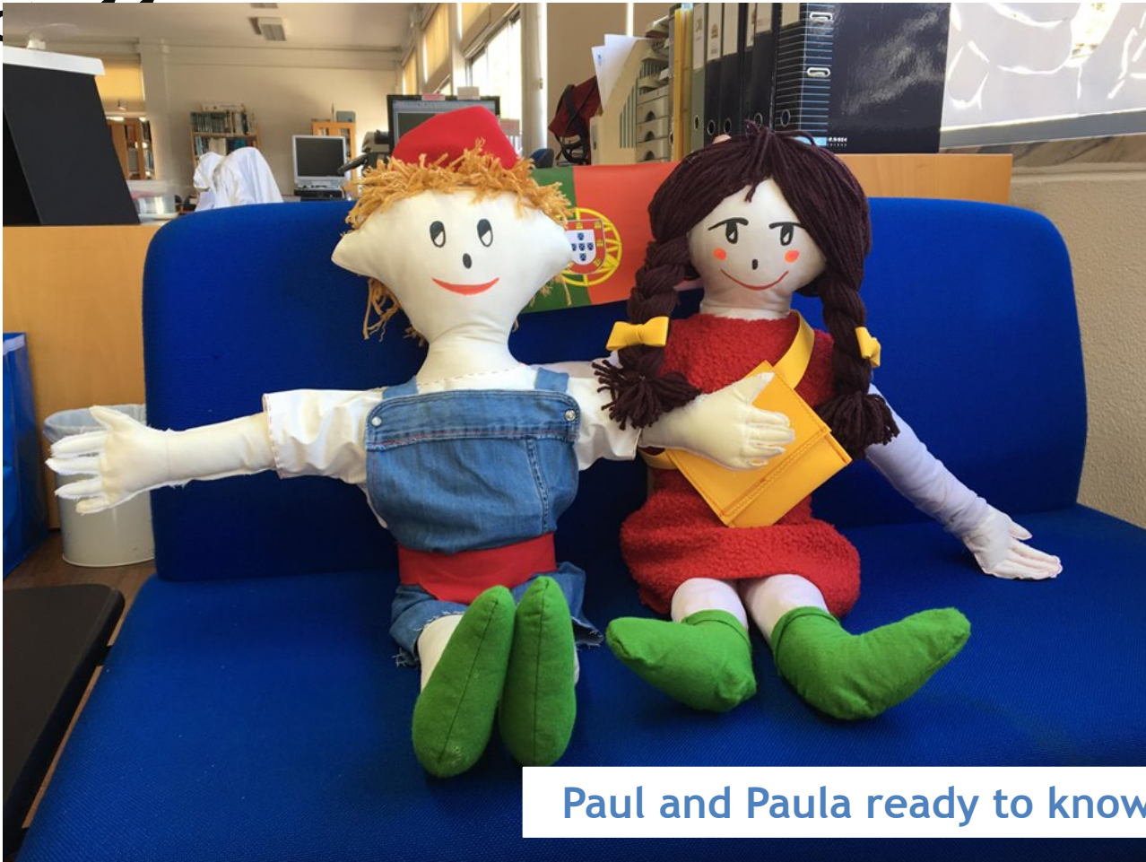
Paul and Paula ready to know us....

January | Playing and acting Paul and Paula story, making scenarios, characters and having a lot of fun